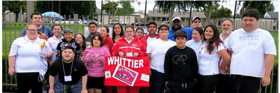
Whittier Sea Monkeys Team