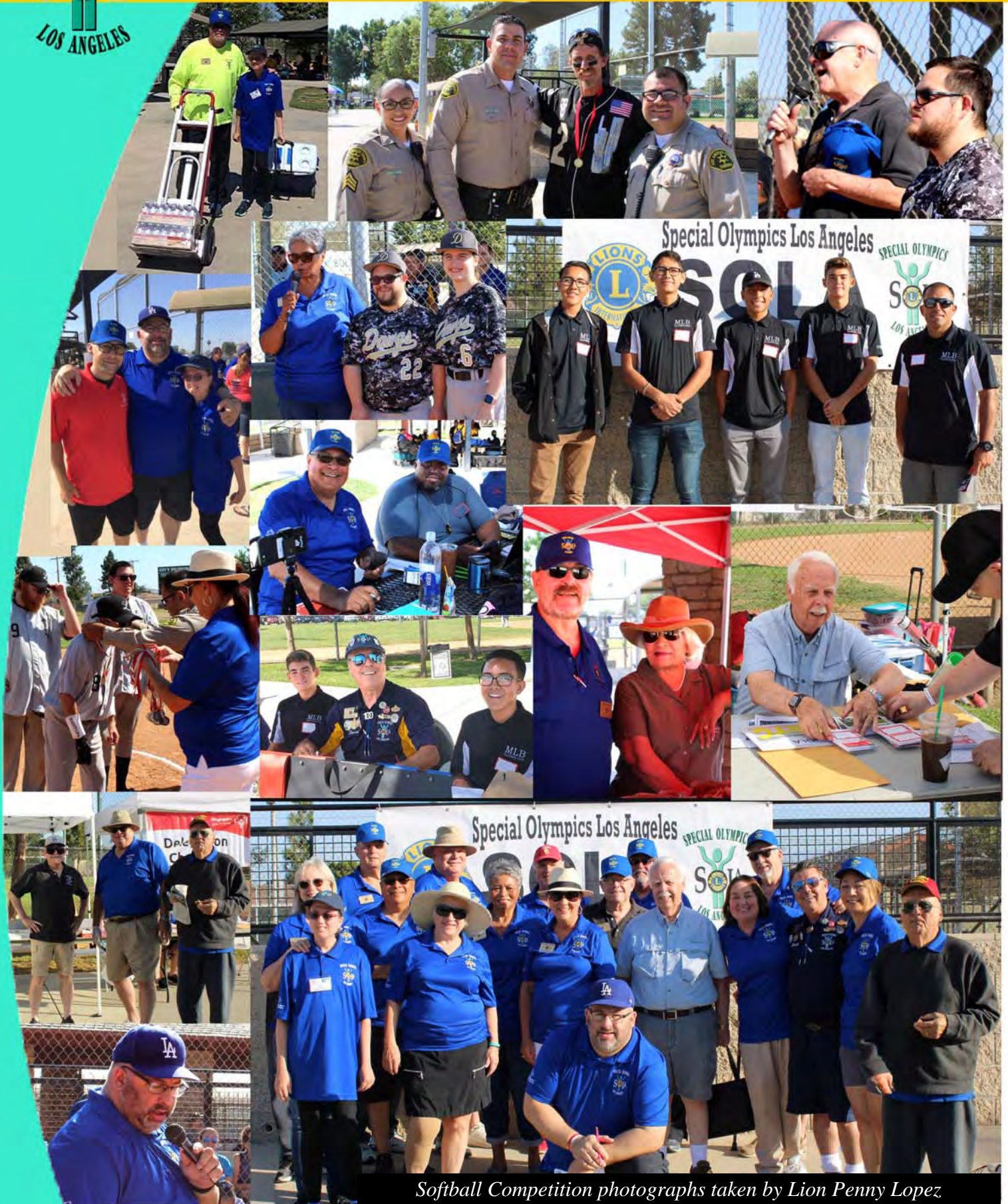
Softball Competition

We Appreciate our Deputy Sheriffs Helping Present the Awards Each Year