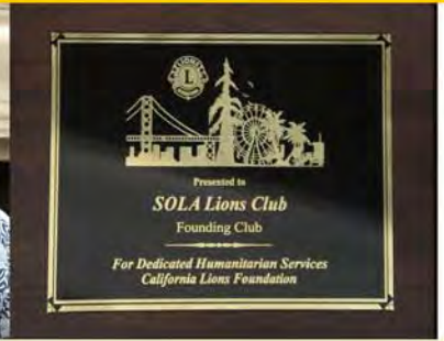
SOLA Lions Club awarded plaque as a Founding Club of C.L.F.