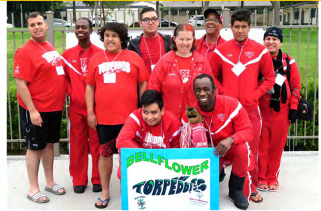
Bellflower Torpedoes Swim Team