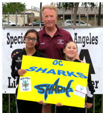
Orange County Sharks Swim Team