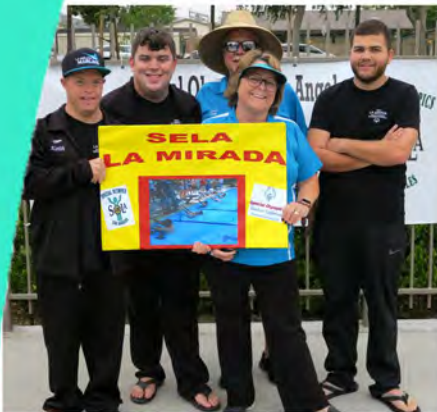
SELA La Mirada Swim Team