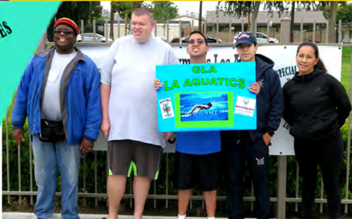
Greater Los Angeles Aquatics Swim Team