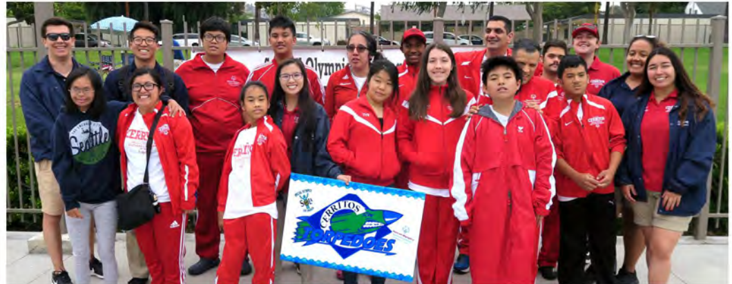
Cerritos Torpedoes Swim Team